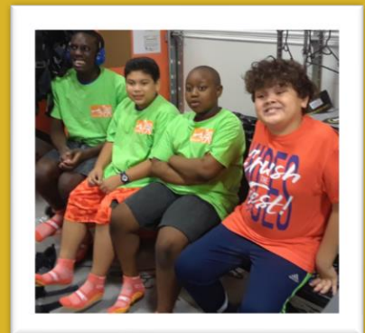
Let's Move Participants at Sky Zone!

Winter/Spring Session begins soon! Dates-2/4-3/27